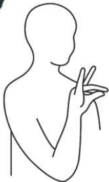
Animal Two middle fingers close onto thumbs

Can you sign some of the words in the Monkey Puzzle story?