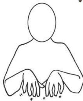
Bat Flutter fingers