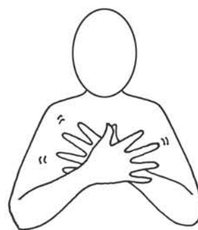
Butterfly Flutter hands and move them slightly upwards and forwards